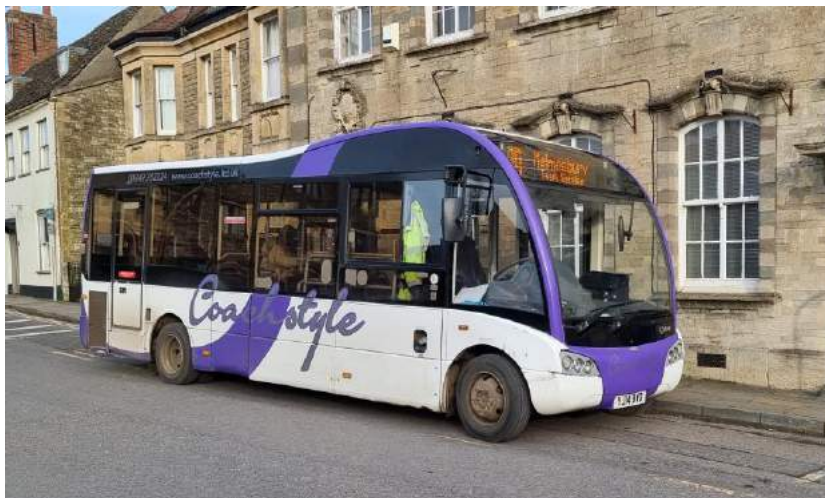
A local bus at rest in Malmesbury.

some buses don't stop in Badminton or Acton Turville.