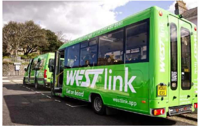
WESTlink buses are very easy to spot!

So, those are the three main bus services that serve our villages, but that's not the end of the story by any means. Say hello to Westlink , those little green buses that have sprung up over the past few months. To quote directly from the Westlink website: "WESTlink is a new type of bus service which operates in the vast majority of the West of England, outside of Bristol and Bath city centres. It runs without a fixed timetable or route, and is booked 'on demand' by users through the WESTlink app or by phone." That's right. If you want a bus, you go on-line or pick up the phone and book one. Simple as that. It's not quite like a taxi, where you can say pick me up in 20 minutes outside my front door, but if, for instance,