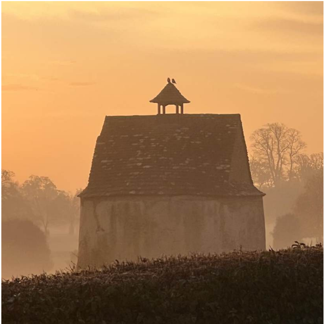
CAN YOU SEE SANTA YET? THE DOVECOTE AT LITTLE BADMINTON. PICTURE BY PIERS TALALLA